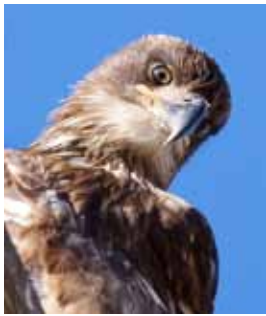
Juvenile Bald Eagle.