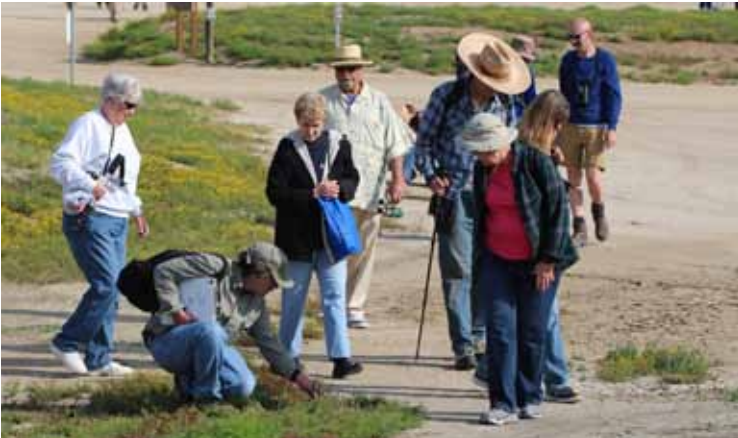
Wildlife enthusiasts stroll through the San Jacinto Wildlife Area during one of the many wildlife walks.

USE EXTREME CAUTION. If raining, call area office for road conditions: (951) 928-0580.