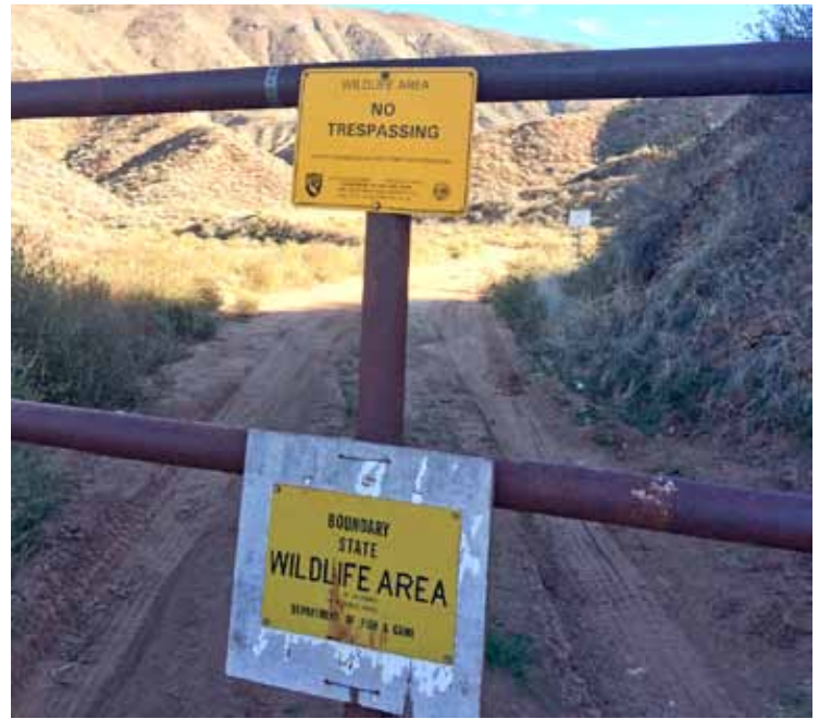
The upper left photo is the Highland Springs Avenue boundary gate for the 9000 acre Potrero Unit of the San Jacinto Wildlife Area (SJWA). The upper right photograph depicts the Lambs Canyon (Highway 79) boundary gate for the Potrero Conservation area.